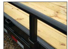
2 3/8" Pipetop Removable Siderails (CC, C8)