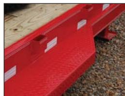
Diamond Plate Running Boards