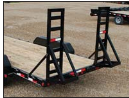
Straight deck w/ 5' Fold-up Ramps