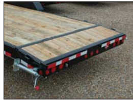
2' Dovetail w/ 5' Slide-in Ramps