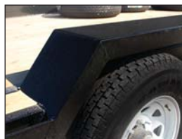
Drive Over Fenders