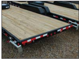
Straight deck w/ 5' Slide-in Ramps