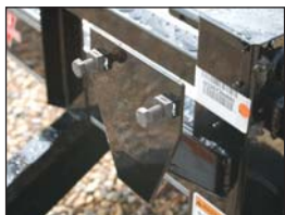
Spare Tire Mount