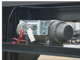
Winch 12VDC (12,000 lb.)