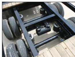
TRAILER FLEX TrailerFlex Air Ride Suspension