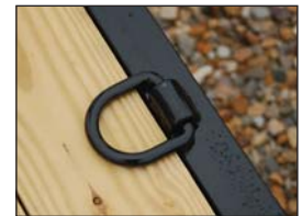
1 Pair D-Rings