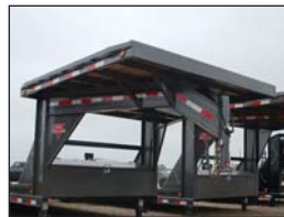
Deck on the Neck (GN Only)