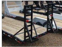
2' Dovetail w/ 5' Fold-up Ramps