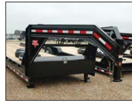
12" I-Beam Gooseneck (C8) 24+ ft only