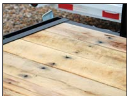
Rough Oak Floor