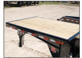
Deck on the Neck