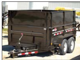
24" Side Extensions (D7)