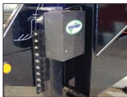
Hydraulic Jack (12,000 lb.)