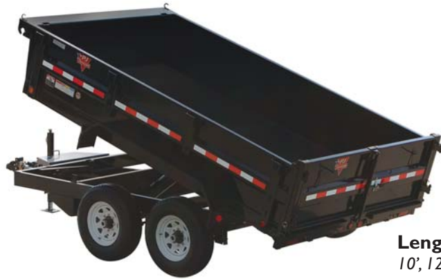
Lengths 10', 12', & 14'