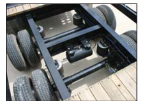
TRAILER FLEX TrailerFlex Air Ride Suspension