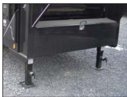
2nd Jack (D7, D8)