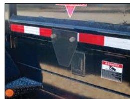
Spare Tire Mount