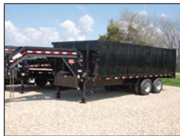
4 ft Removable Sides (DD)