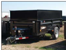
18" Side Extensions (D5)