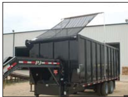
Tandem Dual Dump Tarp