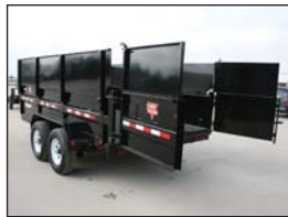
HD 24" 10 Gauge Side Extensions (D7)